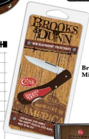
Brooks & Dunn Mini Blackhorn®