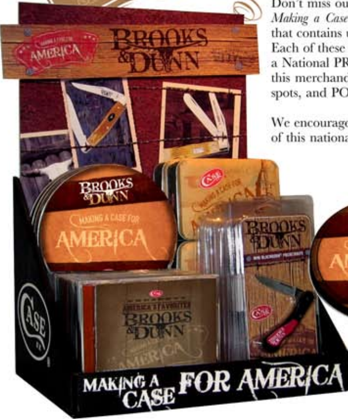
Brooks & Dunn Muskrat Gift Tin Set

We encourage you to order the complete package so you will receive all the tools and benefits of this national campaign. However, individual product is available for order.